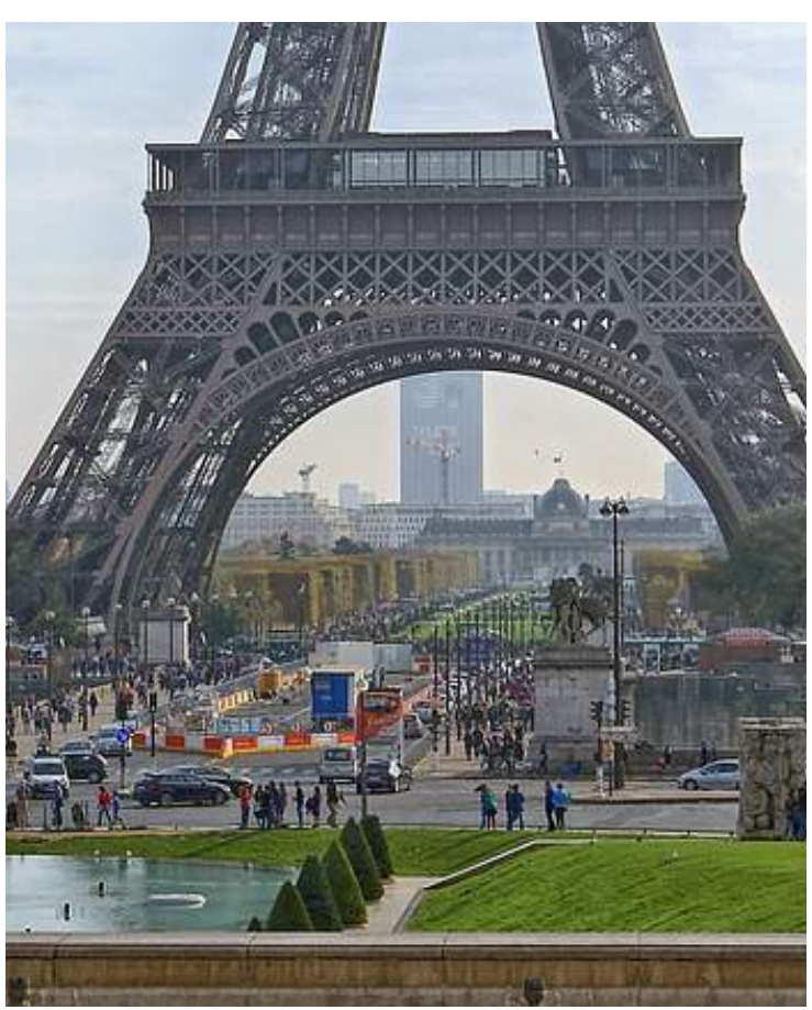
Day 6, Friday

This morning we'll transfer you to Tours where you are free to explore the Musee dex Beaux Arts (and marvel at its ancient Cypress tree in front) at approximately 9am. If you'd like to take a final early morning bike ride – please let your guides know the night before and your bike will be ready for you at 7.30am! We will shuttle you to nearby St Pierre des Corprs TGV station (Tours) where you can return to Paris or the airport, or make any number of rail connections to other regions, or pick up a rental car. There are many fast trains (TGV) to Paris from Tours station (actually called St Pierre des Corps - Tours Centre station does not have TGV facilities). Most folks like to get a train that leaves around 10.30am so they arrive in Paris on time for lunch but rest assured your guides are available to you in Tours until midday. Pedal on!